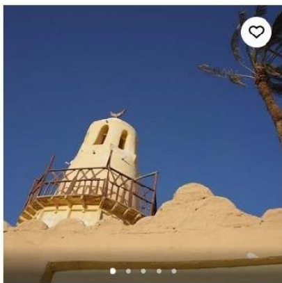
1. Mosque Shaykh Al-Farran ●●●●○ 29 Religious Sites